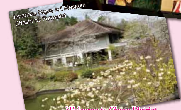
Japanese Paper Art Museum (Washi no Furusato)