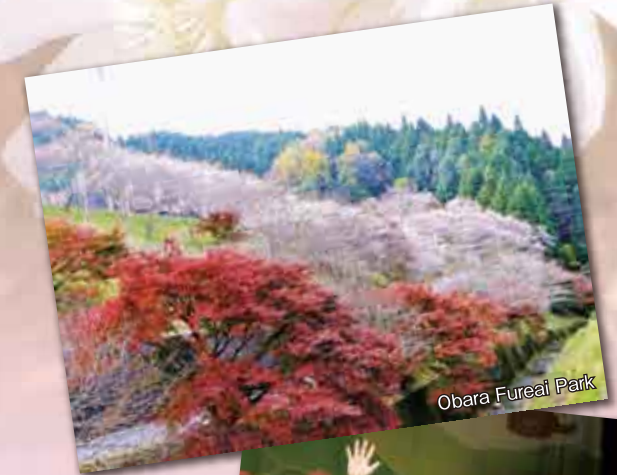
Obara Fureai Park